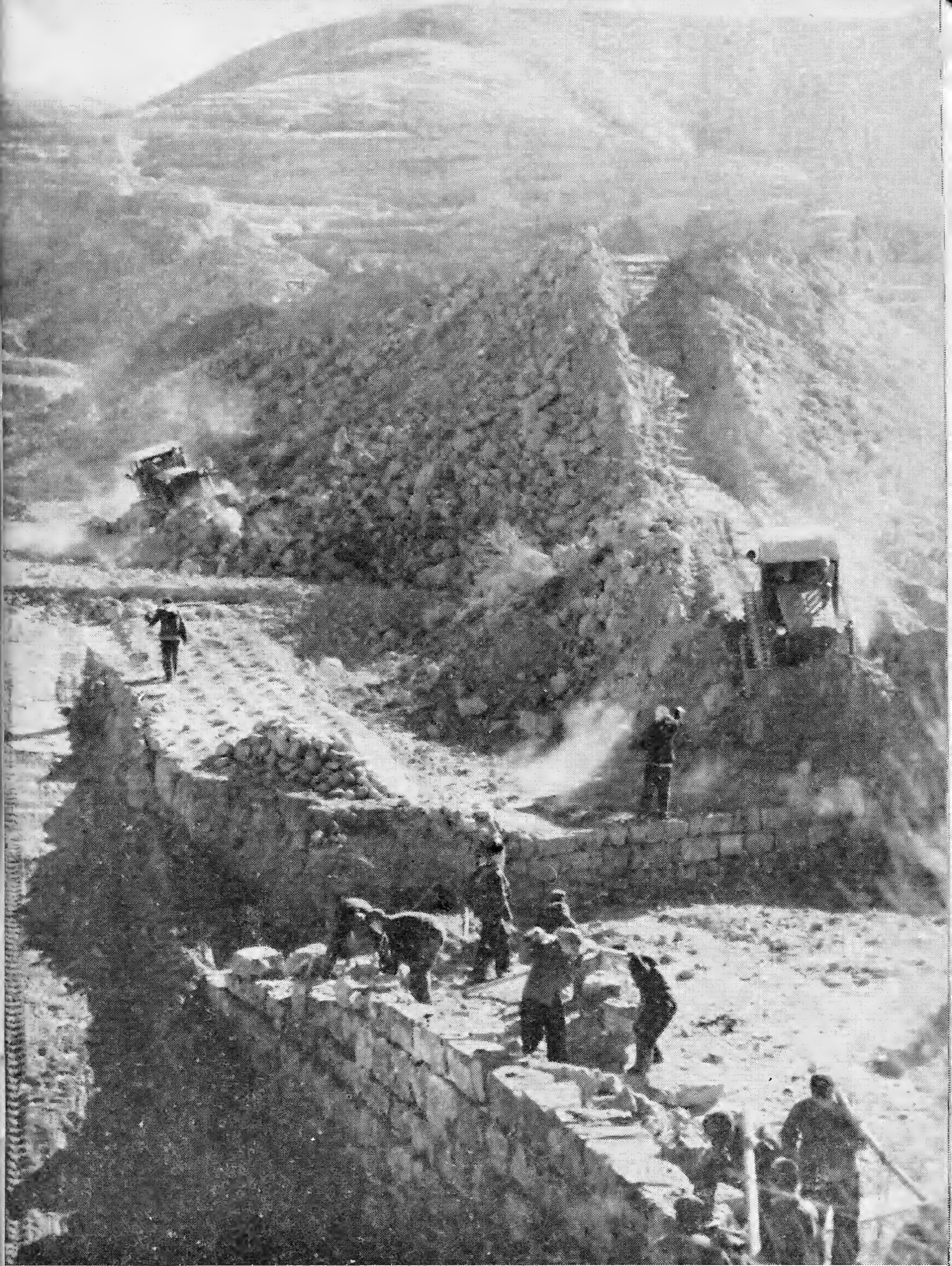
Commune members of the Tachai brigade in Shansi province transform their scattered, tiny fields into levelled stretches of land for mechanized farming and irrigation.